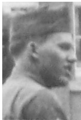
18 (=1 ?)